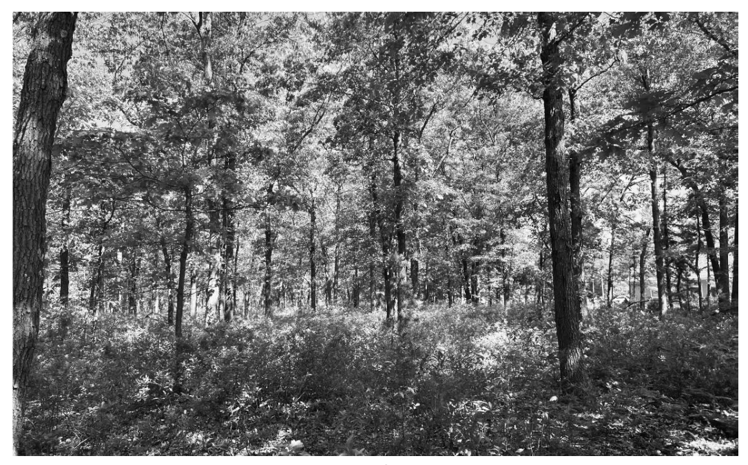
LINKS: WEB PAGE: https://www.planning.co.ocean.nj.us/frmEPNaturalLandTrust INTERACTIVE MAP: https://bit.ly/3peBDz7

The Cherry Street – Lennar Homes property is an approximately 35-acre parcel located off of Cherry Street in Manchester Township. The preserved property is adjacent to 105 acres of existing Natural Lands Trust Fund open space along Cherry Street and is just north of Roosevelt City, which is a 1,200-acre project area under the Natural Lands Program. The previous owners went through the process of subdividing a piece of the property to retain 3 lots for the development of wounded veterans housing. There is a vernal pond on the property, providing unique habitat of upland and wooded wetlands to shelter several important state threatened species.